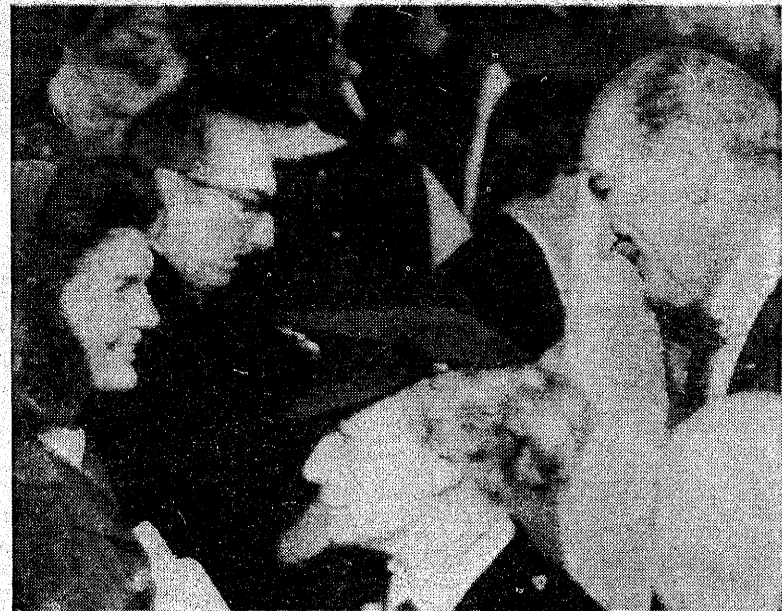
President Johnson stops for a short chat with Mrs. John F. Kennedy at St. Patrick's Cathedral in New York City Thursday where they were attending the installation ceremonies of new Roman Catholic Archbishop Terence J. Cooke. All U.S.