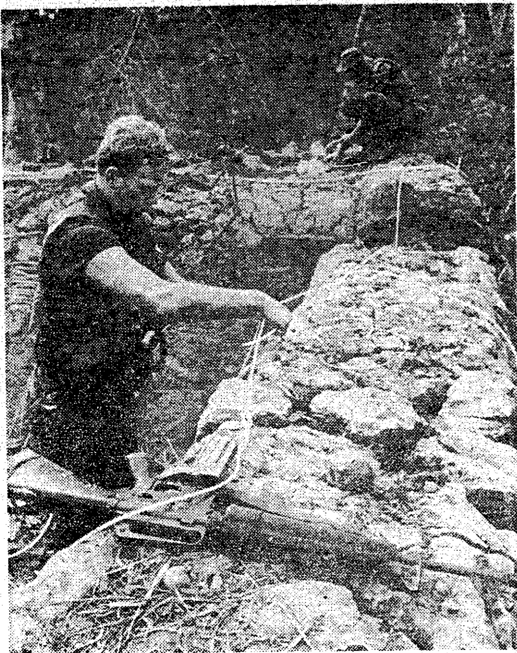
U.S. Navy Seals set charges on a Viet Cong bunker on Tan Dinh Island during an assault in the Mekong Delta by a joint U.S.-Vietnamese Navy task force. (USN)

River patrol boats of River Div. 51 move up the Ti Ti Canal near Tan Dinh Island in the Bassac River. The area, a Viet Cong stronghold, was hit by a combined U.S. Navy and Vietnamese Navy task force. Only one VC was killed but Navy Seals destroyed three bunkers, three fortified buildings and four sampans. (USN)