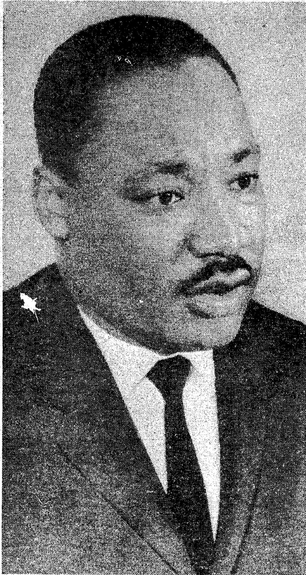
DR. MARTIN LUTHER KING JR.

Afterwards, the President told (Continued on Back Page, Col. 4)