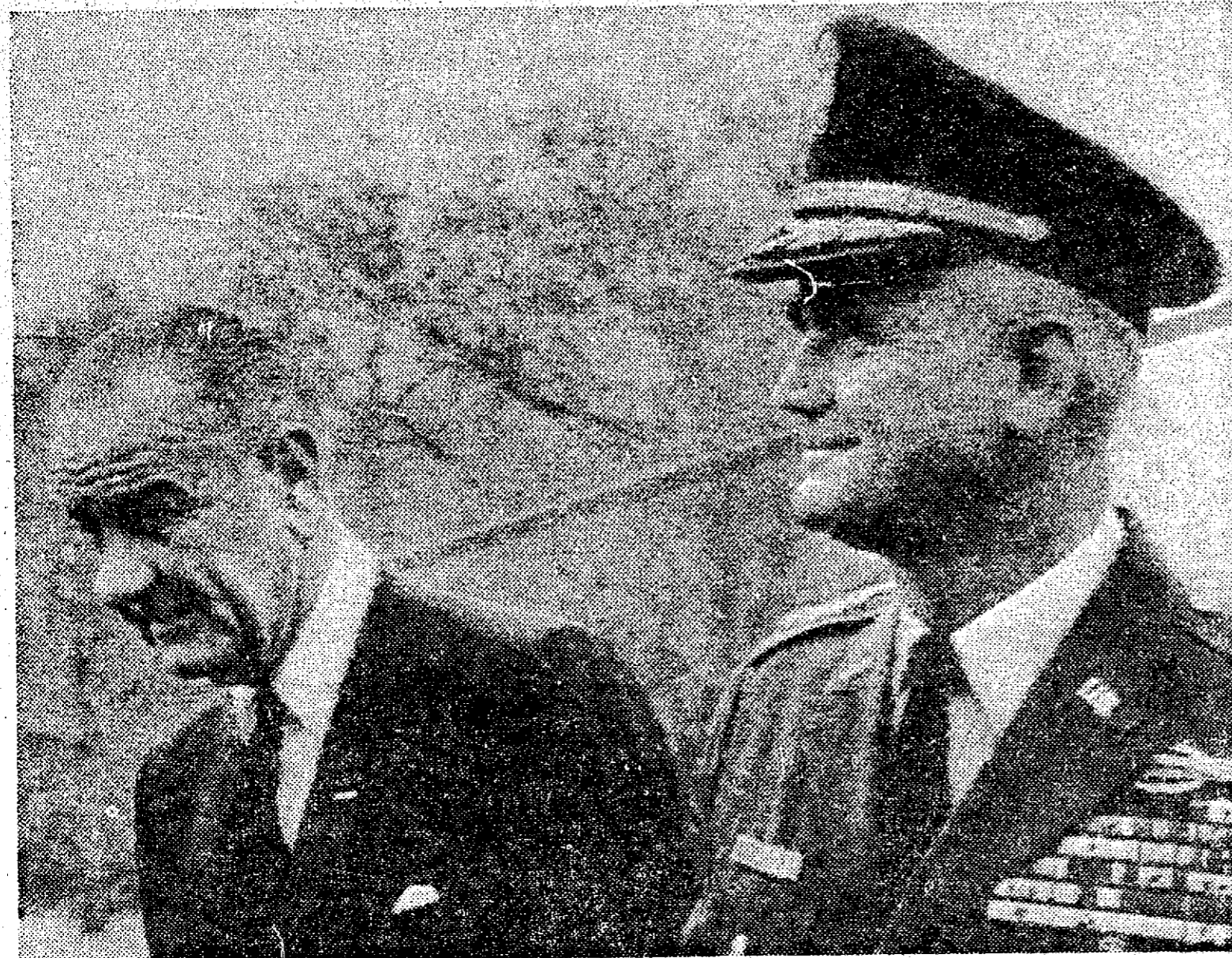
PRESIDENT JOHNSON AND GEN. WILLIAM WESTMORELAND PAUSE ON WHITE HOUSE LAWN.

WASHINGTON (AP)—The White House disclosed Saturday night that—in a direct diplomatic contact with Hanoi—the United States has proposed that American and North Vietnamese envoys talk at Geneva, Switzerland.