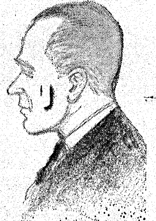
A Memphis Commercial Appeal artist drew this conception of the suspected assassin of Dr. Martin Luther King. He based his sketch on descriptions given by people who live in the building from which the shot was fired.

A spokesman said the flag would be flown at half mast until after the funeral Tuesday on the orders of U.N. Secretary General U Thant, who is currently visiting Geneva and the Benelux countries of Western Europe.