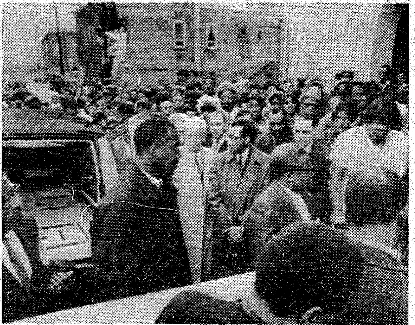
Crowds gather outside Atlanta funeral home Martin Luther King Jr. His body had been flown Friday, awaiting a chance to view body of Dr. from Memphis where he was slain.

Firemen said they heard people scream from inside burning buildings, but weren't able to reach them.