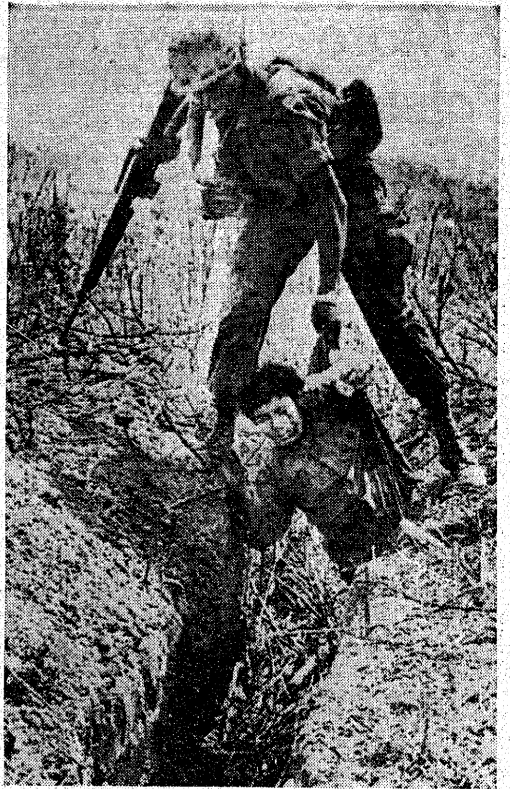
A 1st Air Cav. Div. trooper pulls a wounded Viet Cong from a bunker during a sweep seven miles south of Khe Sanh.

More recently there have been scattered clashes with uniformed NVA regulars and a handful of prisoners have admitted they were infiltrated from the North.