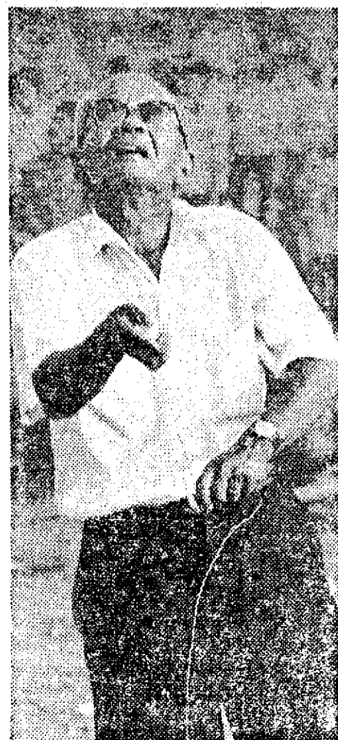
Age is no barrier to enjoying a good kite fight, as this elderly Thai proves while keeping a watchful eye on his airborne contestant.