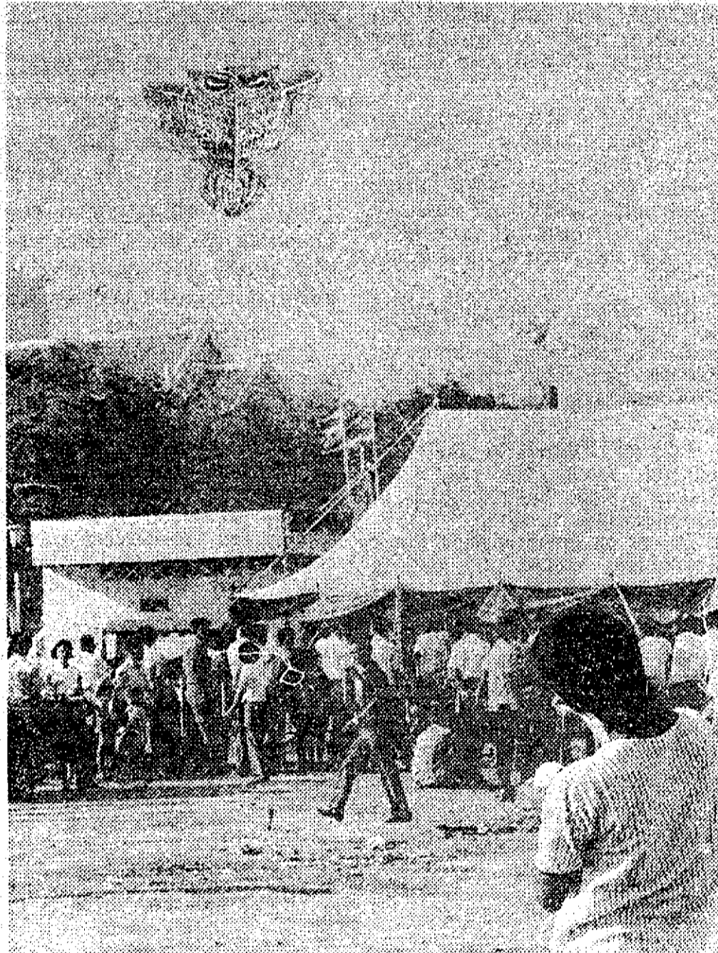
A young Thai gets his fighter airborne as he readies for a contest in Bangkok.

The Indian and Canadian commissioners left aboard a Royal Lao Air Force C47 for Pakse. From there they are scheduled to visit Attopeu, remain overnight at Saravane, visit Laomang Saturday and return to Vientiane.