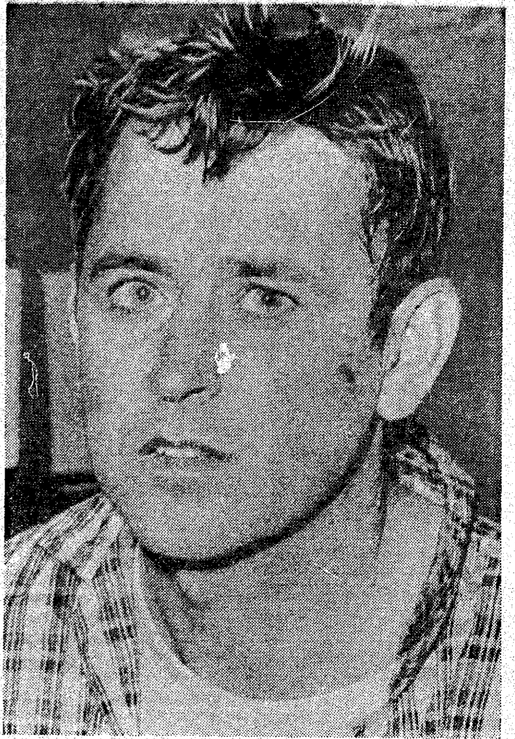
JAMES EARL RAY (Also Eric Starvo Galt)

The sites proposed by Rusk are in 10 countries. Six were Asian countries—Ceylon, Japan, Afghanistan, Pakistan, Nepal and Malaysia—and four European countries—Italy, Belgium, Finland and Austria.