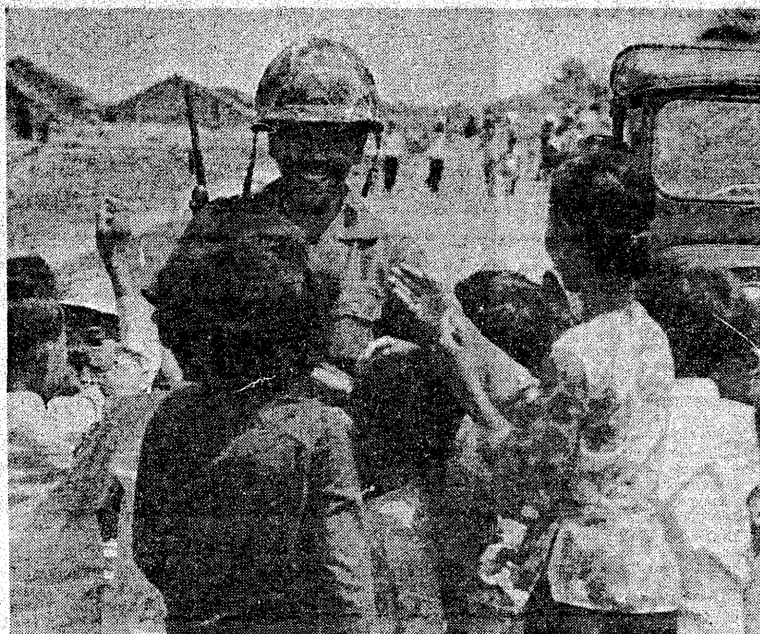
A soldier of the 402nd Psychological Warfare Co., ARVN, gets a welcome in a village south of Bac Lieu. Below, left, the younger generation shows bashful interest, while an oldster, at right below, takes note of the pacification program operations.