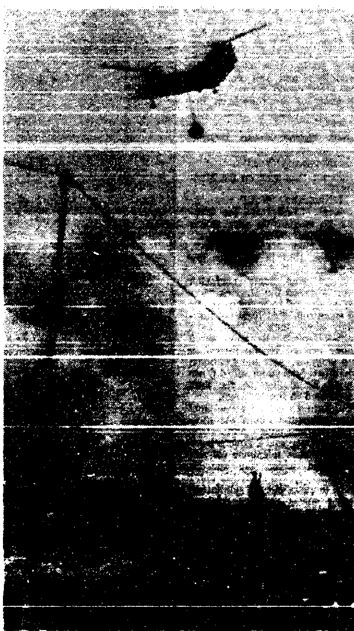
A supply-carrying helicopter circles over the Khe Sanh base, unable to land because of North Vietnamese shelling. Smoke rises from explosions at the base.

To anyone who stays above ground long enough to look around, Khe Sanh looks as though the North Vietnamese already had overrun it. Friday's giant barrage hit a small ammunition dump near the "downtown" or central part of the camp. Another small dump was hit Saturday.