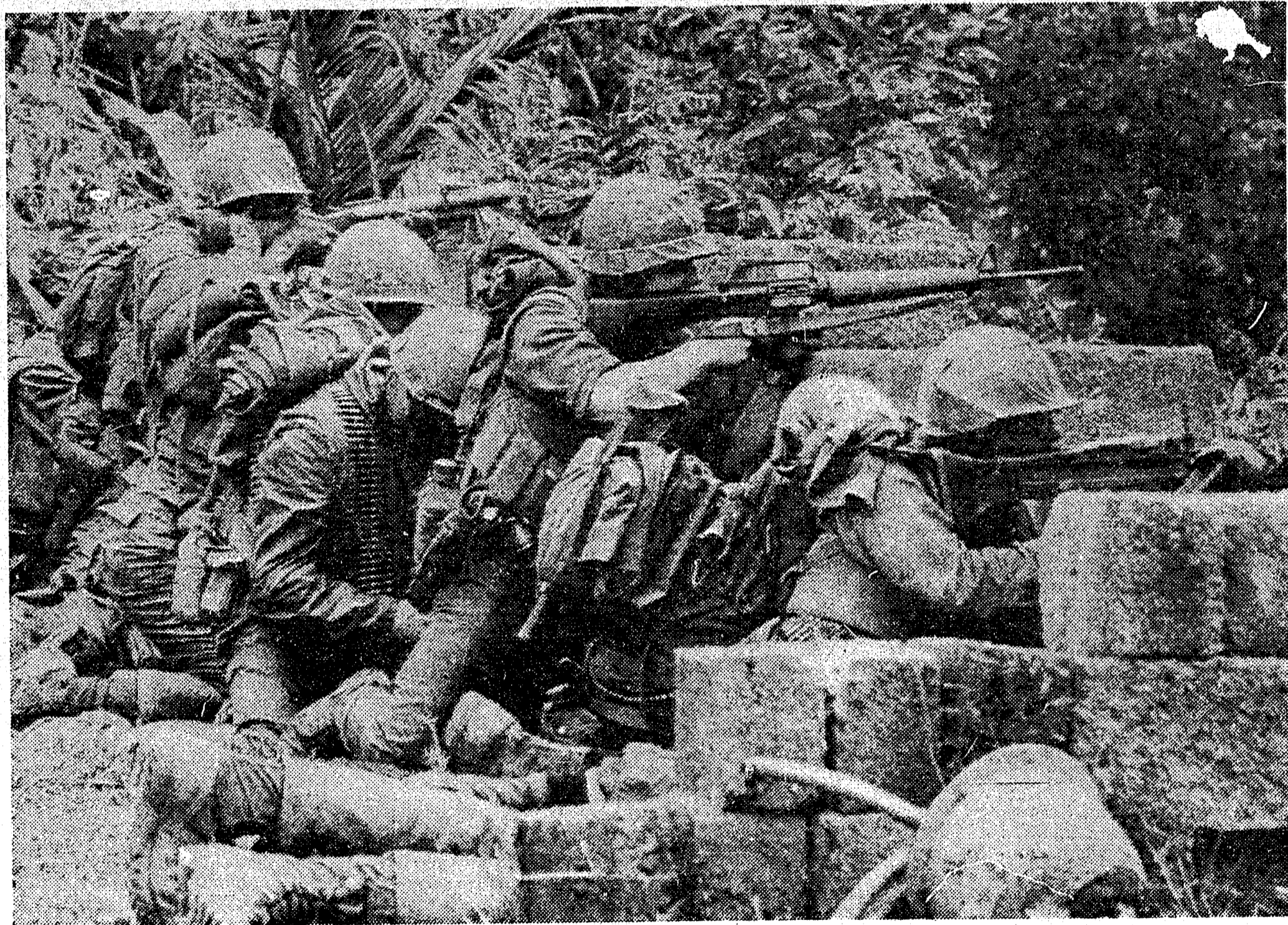
MARINES USE A STONE WALL FOR COVER DURING THE BATTLE FOR CONTROL OF HUE.