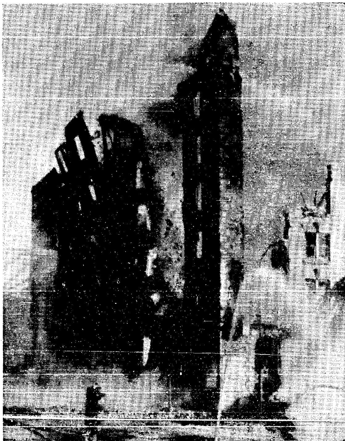
WALLS OF THE FIRE-SWEPT NORMANDIE HOTEL IN PHILADELPHIA CRUMBLE

SAN ANTONIO (AP)—President Johnson announced Monday night the resignation of Budget Director Charles L. Schultze—his chief of staff in developing the financial program of the government which runs to well over $100 billion a year. To replace Schultze, Johnson tapped Assistant Director Charles J. Zwick.