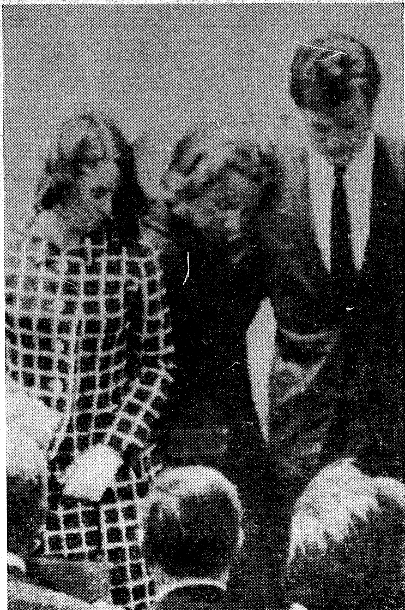
Sen. Edward M. Kennedy (right) comforts Mrs. Robert Kennedy as they and other members of the Kennedy family board a lift at Los Angeles Airport to be put aboard a presidential jet. The slain senator's casket is with them on the lift. At left is Robert Kennedy's daughter Kathleen, 16. The senator's body will lie in state in New York.