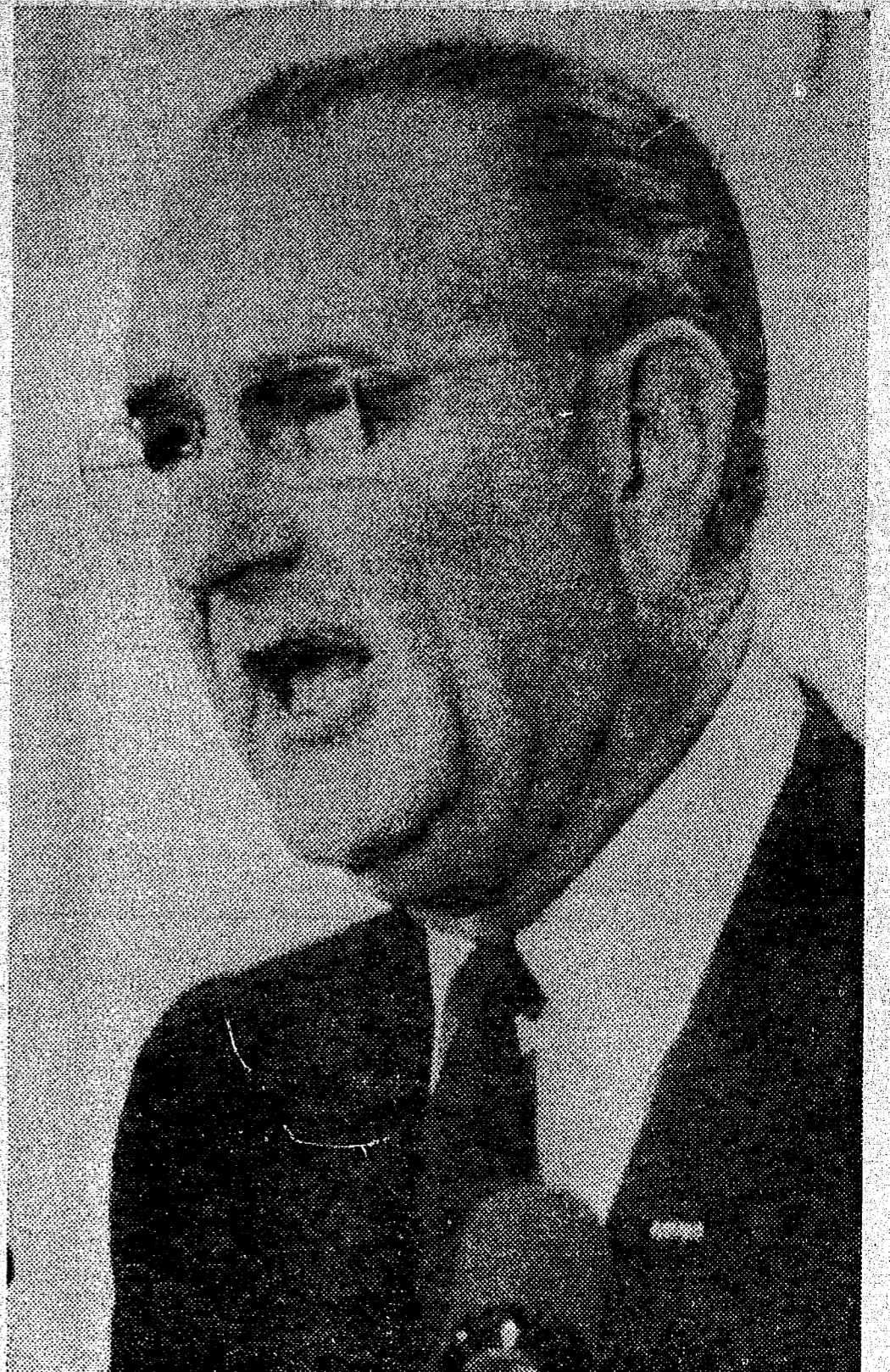
President Johnson addresses the nation on television from the White House on the assassination of Sen. Robert F. Kennedy.

"By rising to that challenge we can serve the nation as we honor their memories."