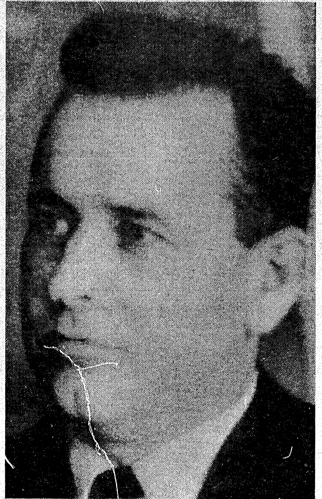
JAMES EARL RAY

There the African mahogany casket was placed aboard the train for the 200 mile trip to the nation's capital.