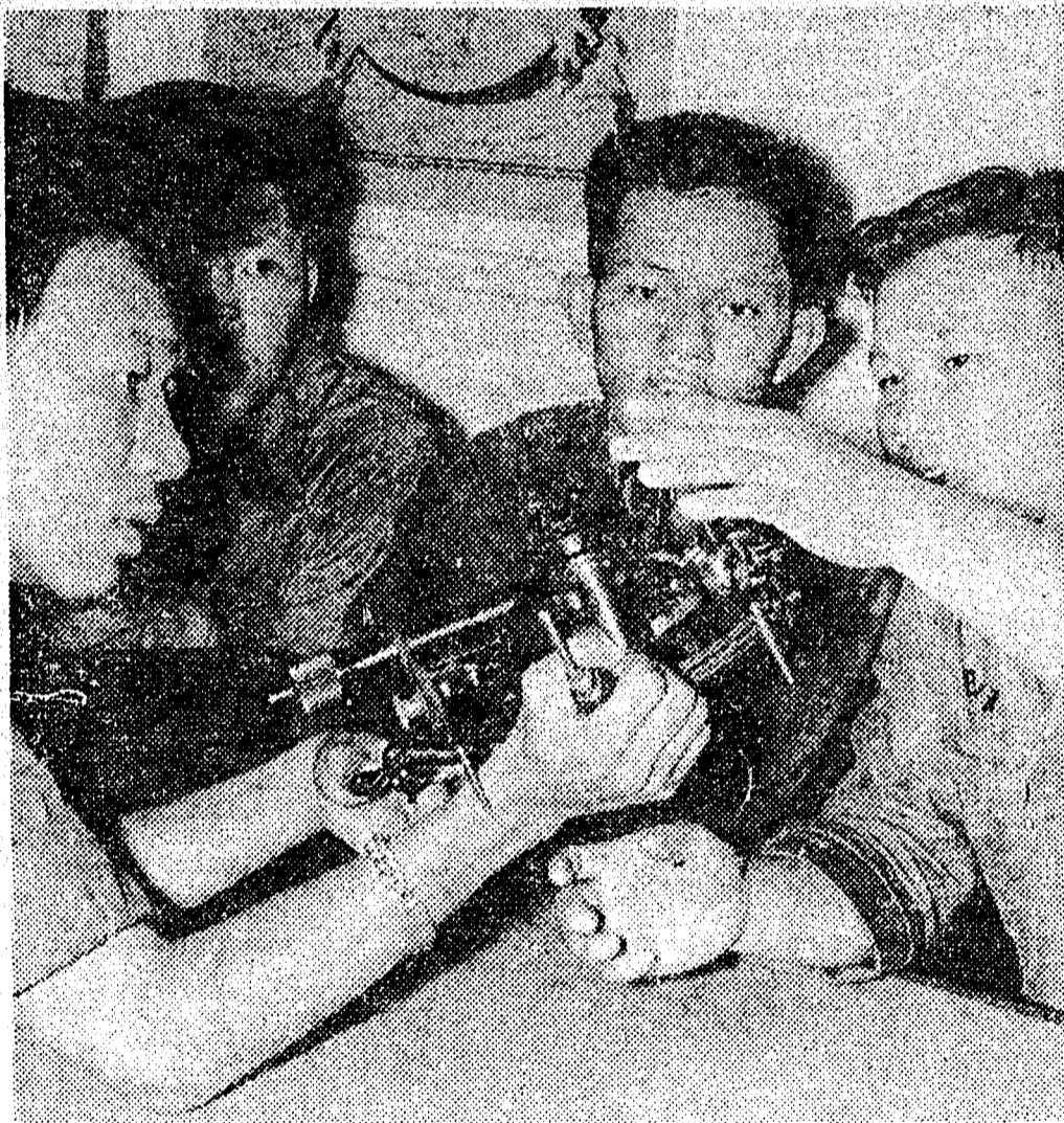
Midshipmen at the Naval Training Center of the Vietnam Navy study the use of the sextant in a navigation course.