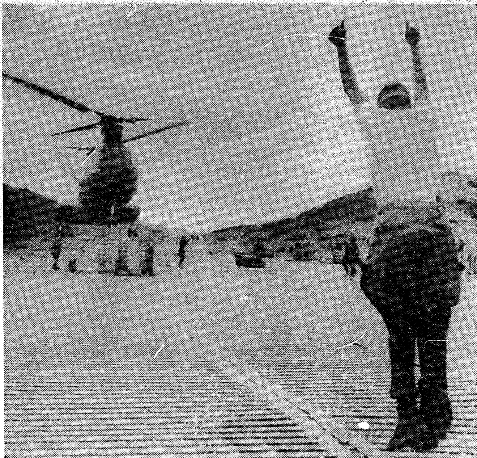
Major action at present is centered in the area surrounding Saigon, but the work of supplying Marine units in northern areas goes on. A "parking attendant" leaps to signal the lift-off of a resupply helicopter from Landing Zone Stud, 12 miles east of Khe Sanh.

HASLINGDEN, England (UPI)—Farmer Eddie Winterbotham, plagued by chicken thieves, bought a watch dog for protection. The thieves struck again this week and stole his watch dog and a fresh batch of pullets.