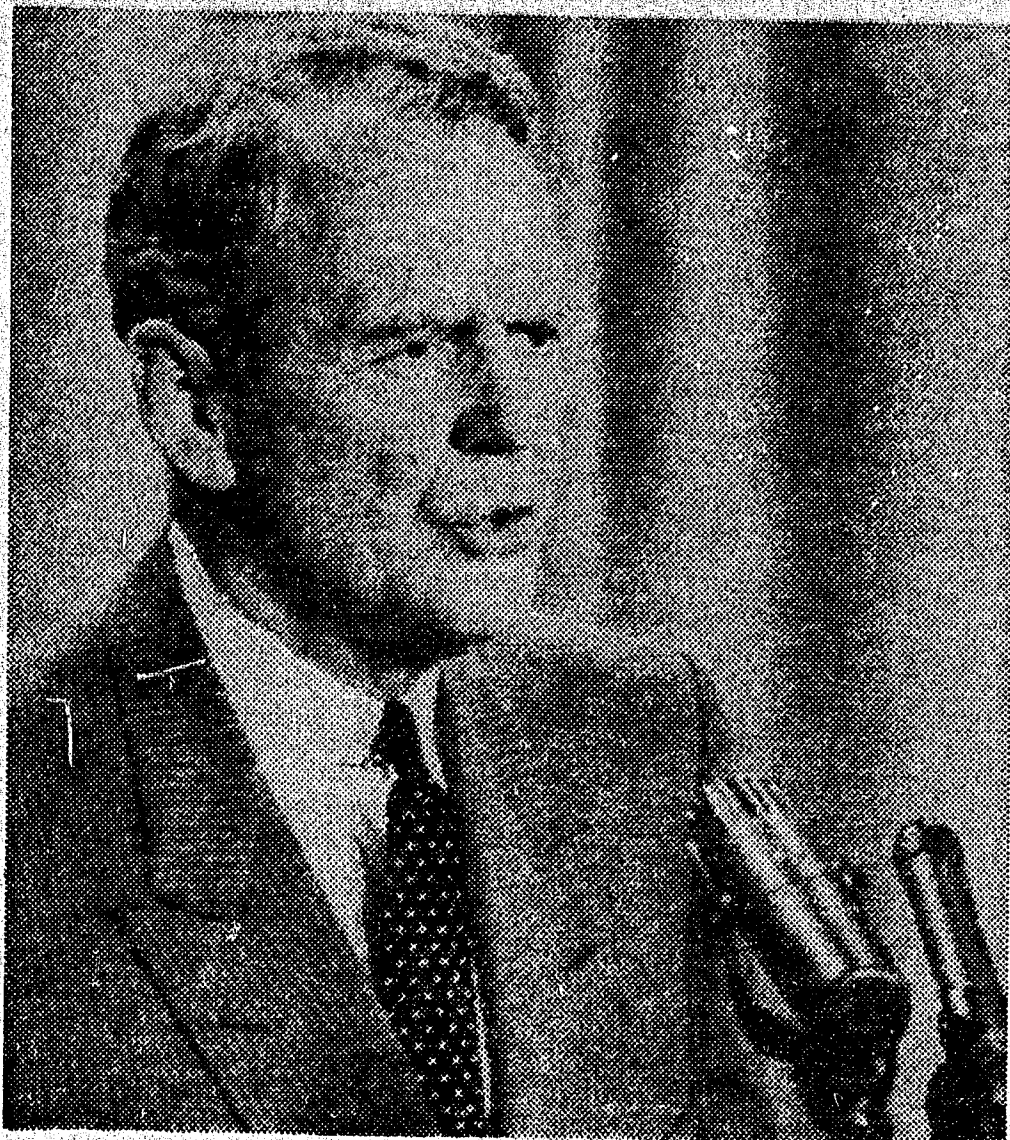
Secretary of Defense Clark Clifford tells newsmen at a Washington press conference that he sees some movement toward more encouraging talks at the previously stalemated Paris peace meetings.

A spokesman said all the passengers boarded the plane in Santo Domingo and that passengers who had flown from Miami, Fla., to Santo Domingo on the plane all got off in the Dominican Republic.