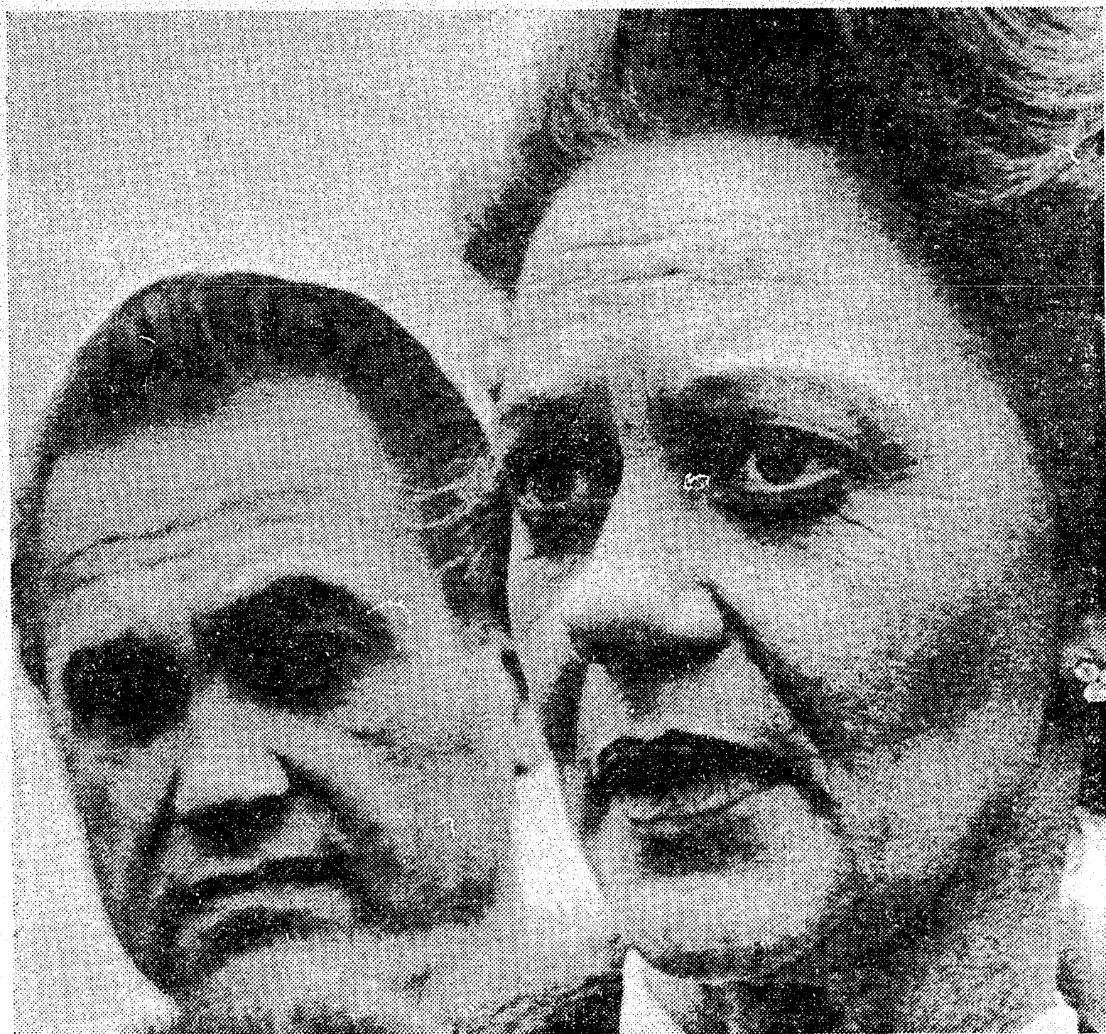
George Wallace and his wife, Alabama Gov. Lurleen Wallace, are shown at a Houston hospital where Mrs. Wallace recently underwent treatment for a recurrence of cancer.

For purse distribution, it's: 1. Forward Pass; 2. Francie's Hat; 3. T.V. Commercial.